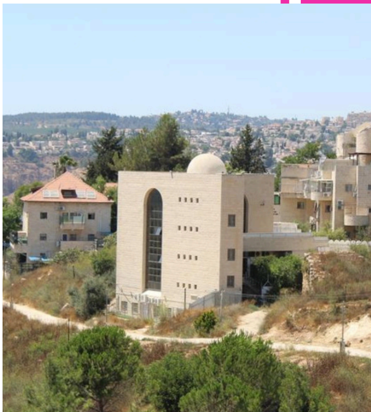
THE SCHOOL BUILDING

Each of our apartments are equipped with a dairy kitchen and a living room, along with full bathrooms and bedrooms. Our bedrooms and living rooms are air-conditioned, heated, and furnished to make your "home away from home" cozy and comfortable.